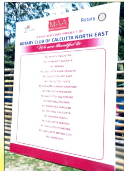
2nd project as Co host with New Ballygunje a panel discussion on PoCSO act