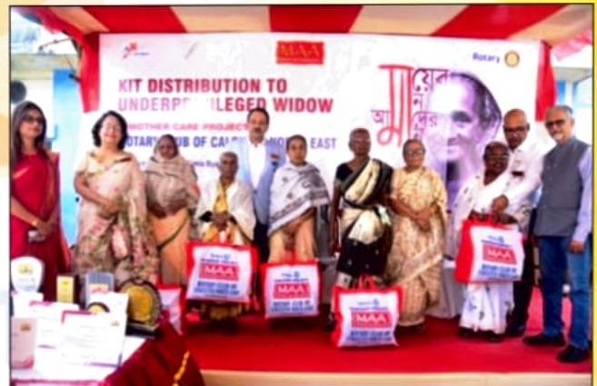
Co host of Ma Project of Calcutta North East